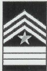
CADET SERGEANT MAJOR