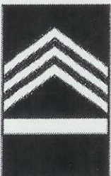
CADET STAFF SERGEANT