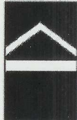
CADET PRIVATE FIRST CLASS