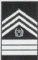
CADET COMMAND SERGEANT MAJOR