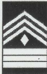
CADET FIRST SERGEANT