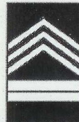
CADET SERGEANT FIRST CLASS