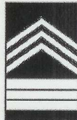
CADET MASTER SERGEANT